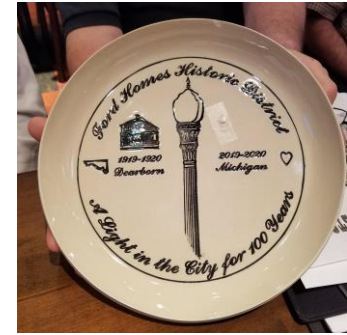
With Porch Bracket/Model/Cut Out