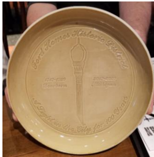
Amber Celadon Glaze (1)