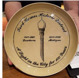
Amber Celadon w/Black Inlay (2)