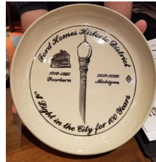
Clear Glaze w/Black Inlay (3)